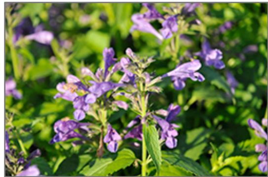
Prelude Purple Catmint flowers