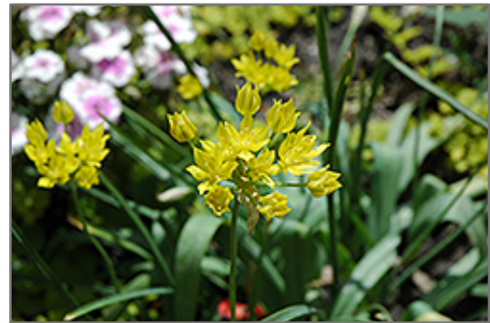
Golden Garlic flowers