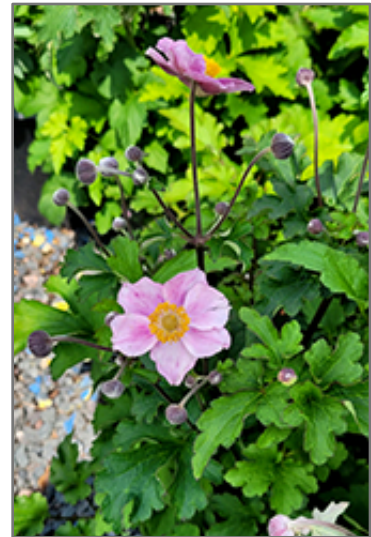
Pink Saucer Anemone flowers

Pink Saucer Anemone is recommended for the following landscape applications;