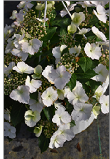
Fairytrail Bride Cascade Hydrangea flowers