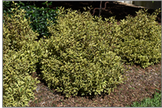
Bubbly Wine Weigela

Bubbly Wine Weigela will grow to be about 24 inches tall at maturity, with a spread of 3 feet. It tends to fill out right to the ground and therefore doesn't necessarily require facer plants in front. It grows at a medium rate, and under ideal conditions can be expected to live for approximately 30 years.