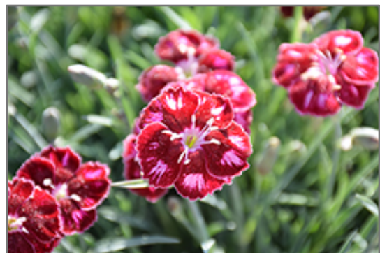
Mountain Frost Ruby Glitter Pinks flowers