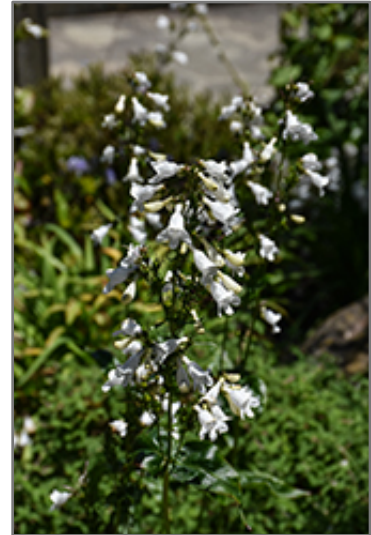
Foxglove Beardtongue flowers

Foxglove Beardtongue is recommended for the following landscape applications;