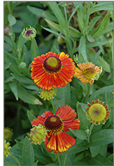
Sahin's Early Flowerer Sneezeweed flowers

This plant will require occasional maintenance and upkeep, and should be cut back in late fall in preparation for winter. It is a good choice for attracting butterflies to your yard, but is not particularly attractive to deer who tend to leave it alone in favor of tastier treats. Gardeners should be aware of the following characteristic(s) that may warrant special consideration;