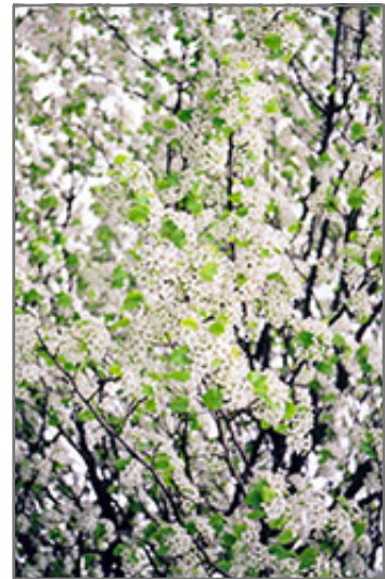
Bradford Ornamental Pear flowers