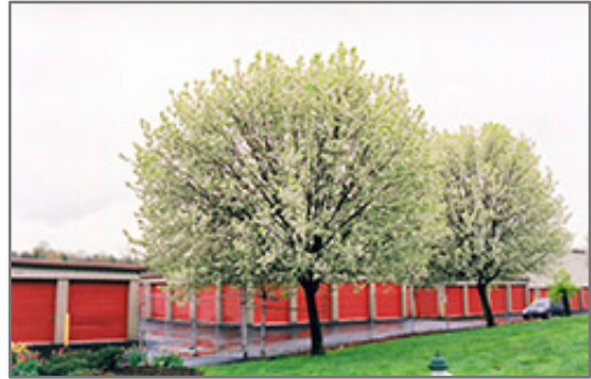
Bradford Ornamental Pear in bloom

Bradford Ornamental Pear is recommended for the following landscape applications;