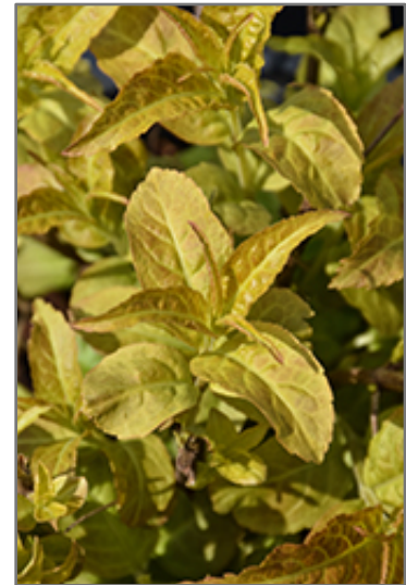
Firefly Diervilla foliage