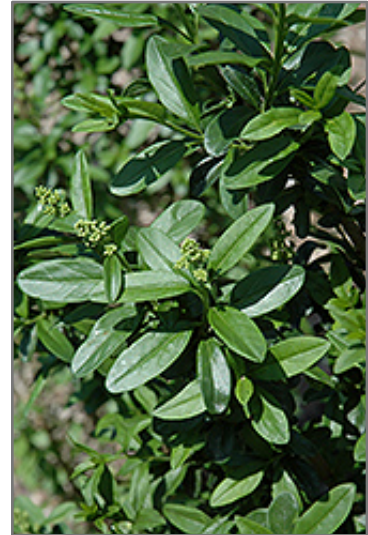
California Privet foliage