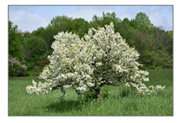
Lollipop Flowering Crab in bloom

This is a high maintenance shrub that will require regular care and upkeep, and is best pruned in late winter once the threat of extreme cold has passed. Gardeners should be aware of the following characteristic(s) that may warrant special consideration;