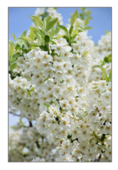
Lollipop Flowering Crab flowers