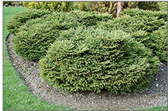
Creeping Norway Spruce