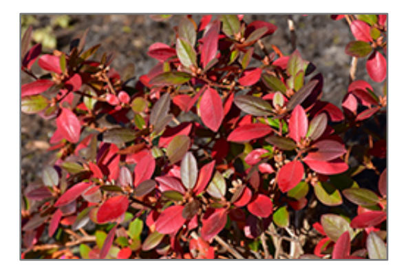
P.J.M. Rhododendron in fall

This shrub does best in full sun to partial shade. You may want to keep it away from hot, dry locations that receive direct afternoon sun or which get reflected sunlight, such as against the south side of a white wall. It requires an evenly moist well-drained soil for optimal growth, but will die in standing water. It is very fussy about its soil conditions and must have rich, acidic soils to ensure success, and is subject to chlorosis (yellowing) of the foliage in alkaline soils. It is somewhat tolerant of urban pollution, and will benefit from being planted in a relatively sheltered location. Consider applying a thick mulch around the root zone in winter to protect it in exposed locations or colder microclimates. This particular variety is an interspecific hybrid.