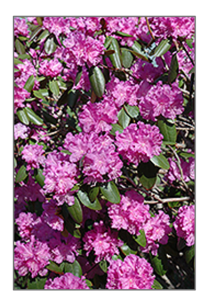
P.J.M. Rhododendron flowers

CustomerCare@WestonNurseries.com 93 East Main Street Hopkinton MA 02148 - (508) 435-3414 160 Pine Hill Road Chelmsford MA 01824 - (978) 349-0055 COMMERCIAL: commsales@westonnurseries.com - (508) 293-8028