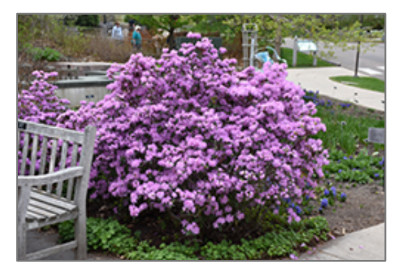
P.J.M. Rhododendron in bloom

P.J.M. Rhododendron is recommended for the following landscape applications;