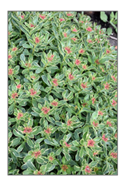
Variegated Russian Stonecrop foliage