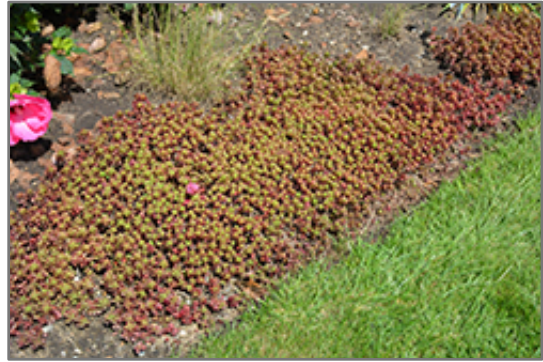
Fulda Glow Stonecrop

Fulda Glow Stonecrop is a fine choice for the garden, but it is also a good selection for planting in outdoor pots and containers. Because of its spreading habit of growth, it is ideally suited for use as a 'spiller' in the 'spiller-thriller-filler' container combination; plant it near the edges where it can spill gracefully over the pot. Note that when growing plants in outdoor containers and baskets, they may require more frequent waterings than they would in the yard or garden.