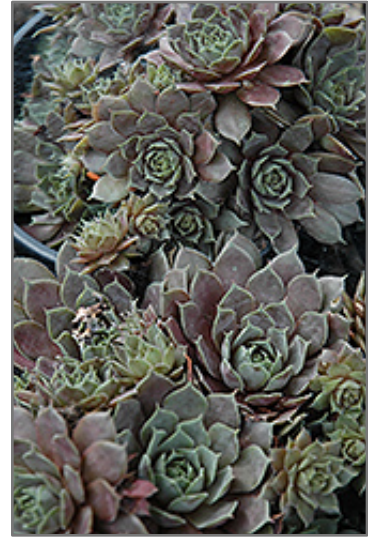
Silverine Hens And Chicks foliage