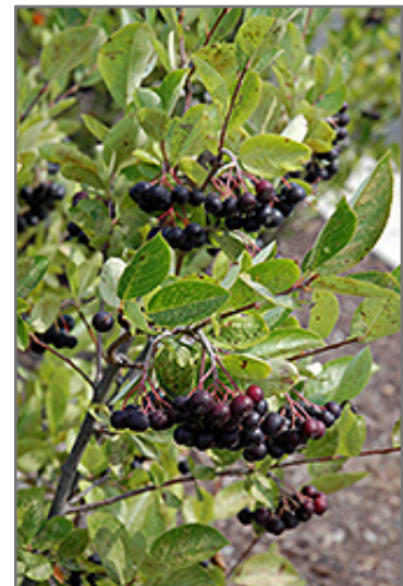
Iroquois Beauty Black Chokeberry fruit