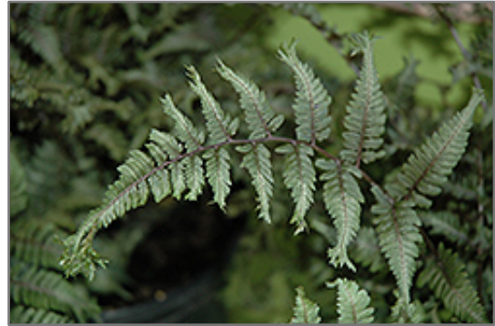
Applecourt Painted Fern foliage