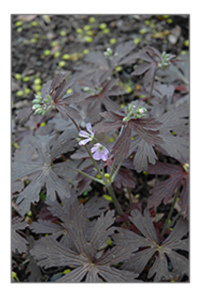
Elizabeth Ann Cranesbill flowers