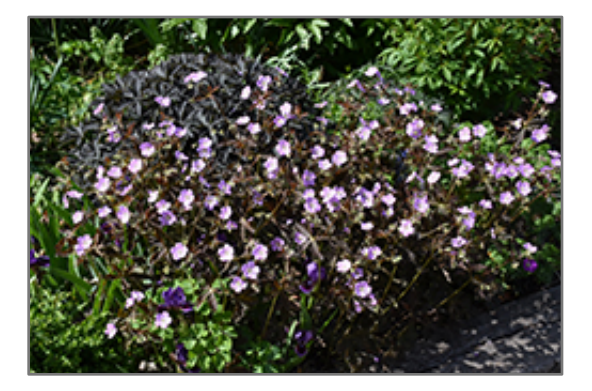
Elizabeth Ann Cranesbill in bloom

This plant will require occasional maintenance and upkeep, and should only be pruned after flowering to avoid removing any of the current season's flowers. Deer don't particularly care for this plant and will usually leave it alone in favor of tastier treats. Gardeners should be aware of the following characteristic(s) that may warrant special consideration;