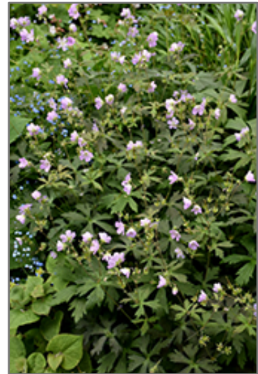
Espresso Cranesbill in bloom

Espresso Cranesbill is a fine choice for the garden, but it is also a good selection for planting in outdoor pots and containers. It is often used as a 'filler' in the 'spiller-thriller-filler' container combination, providing a mass of flowers and foliage against which the thriller plants stand out. Note that when growing plants in outdoor containers and baskets, they may require more frequent waterings than they would in the yard or garden.