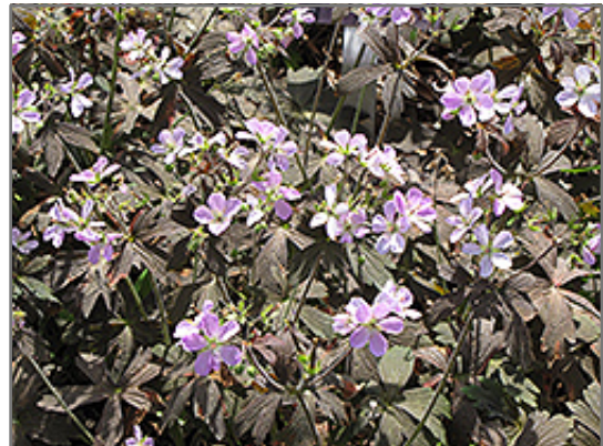
Espresso Cranesbill flowers