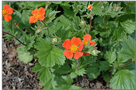
Boris Avens flowers

Boris Avens is recommended for the following landscape applications;