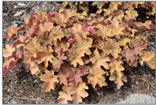
Caramel Coral Bells

Caramel Coral Bells is a fine choice for the garden, but it is also a good selection for planting in outdoor pots and containers. It is often used as a 'filler' in the 'spiller-thriller-filler' container combination, providing a mass of flowers and foliage against which the larger thriller plants stand out. Note that when growing plants in outdoor containers and baskets, they may require more frequent waterings than they would in the yard or garden.