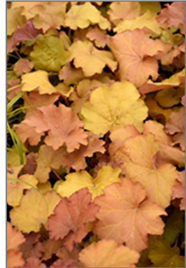
Caramel Coral Bells foliage

Caramel Coral Bells is recommended for the following landscape applications;