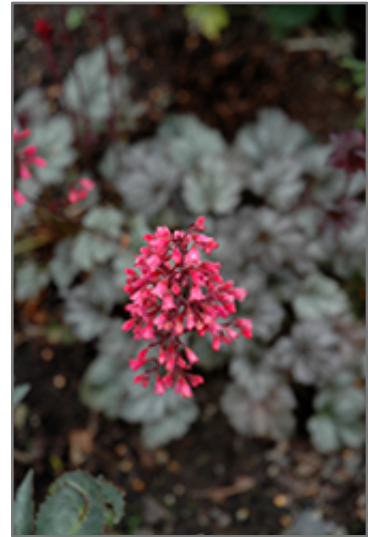
Rave On Coral Bells flowers