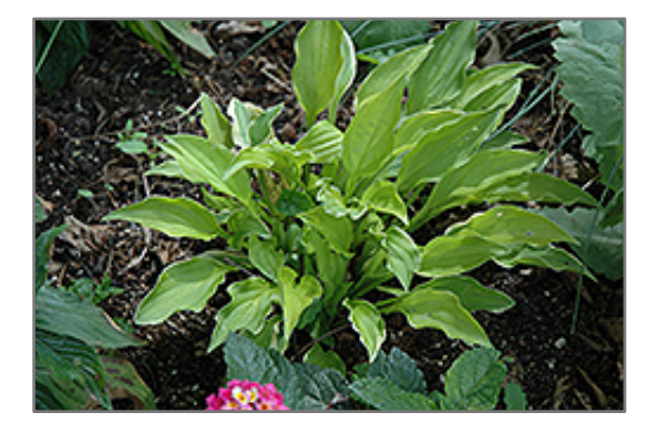
Lakeside Down Sized Hosta

CustomerCare@WestonNurseries.com 93 East Main Street Hopkinton MA 02148 - (508) 435-3414 160 Pine Hill Road Chelmsford MA 01824 - (978) 349-0055 COMMERCIAL: commsales@westonnurseries.com - (508) 293-8028