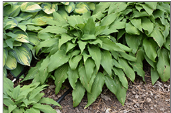
Red October Hosta