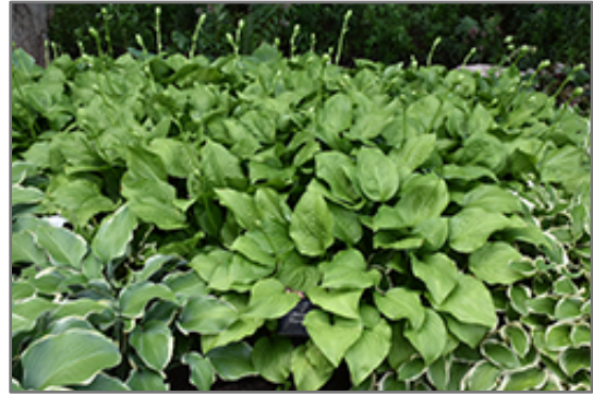
Royal Standard Hosta

Royal Standard Hosta is recommended for the following landscape applications;