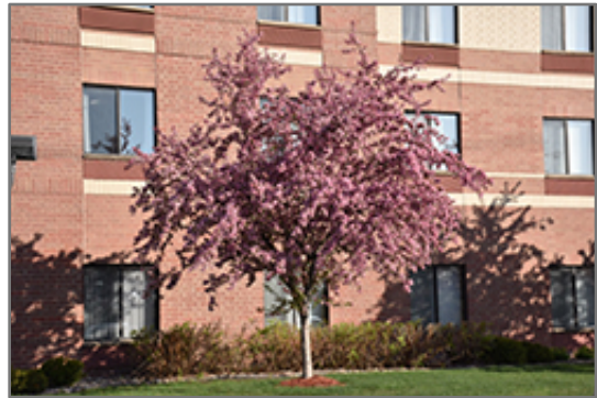
Robinson Flowering Crab in bloom

Robinson Flowering Crab is recommended for the following landscape applications;