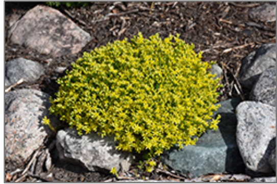
Golden Moss Stonecrop in bloom

Golden Moss Stonecrop is recommended for the following landscape applications;