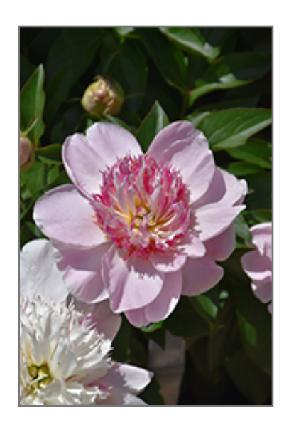
Do Tell Peony flowers