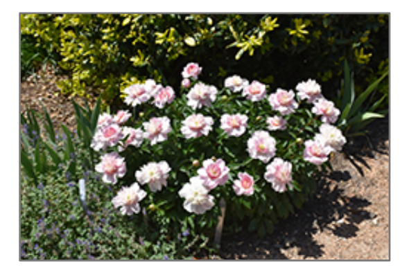
Do Tell Peony in bloom