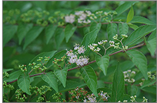
Issai Beautyberry flowers

Issai Beautyberry makes a fine choice for the outdoor landscape, but it is also well-suited for use in outdoor pots and containers. Because of its height, it is often used as a 'thriller' in the 'spiller-thriller-filler' container combination; plant it near the center of the pot, surrounded by smaller plants and those that spill over the edges. It is even sizeable enough that it can be grown alone in a suitable container. Note that when grown in a container, it may not perform exactly as indicated on the tag - this is to be expected. Also note that when growing plants in outdoor containers and baskets, they may require more frequent waterings than they would in the yard or garden.