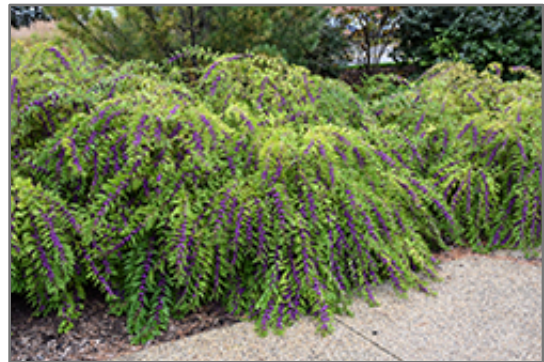
Issai Beautyberry fruit