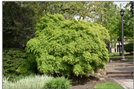
Cutleaf Japanese Maple