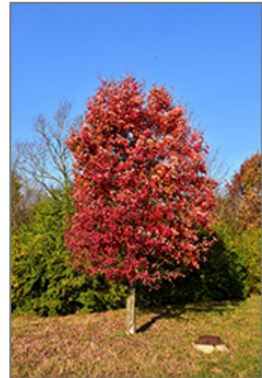
Autumn Flame Red Maple in fall