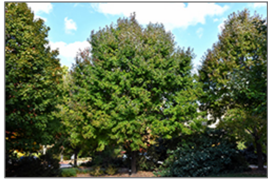
Autumn Flame Red Maple

This tree should only be grown in full sunlight. It is quite adaptable, preferring to grow in average to wet conditions, and will even tolerate some standing water. It is not particular as to soil type, but has a definite preference for acidic soils, and is subject to chlorosis (yellowing) of the foliage in alkaline soils. It is somewhat tolerant of urban pollution. This is a selection of a native North American species.