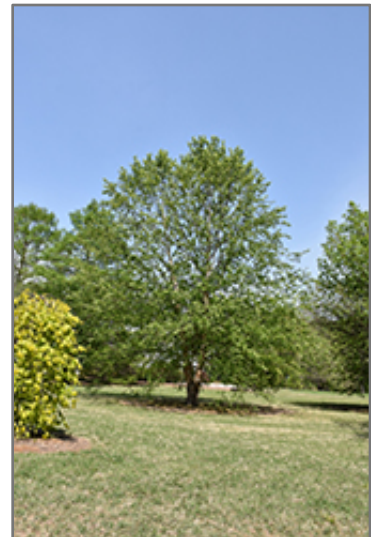
Dura Heat River Birch