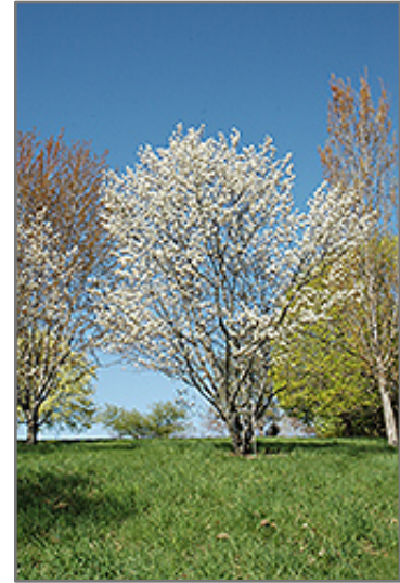
Princess Diana Serviceberry in bloom