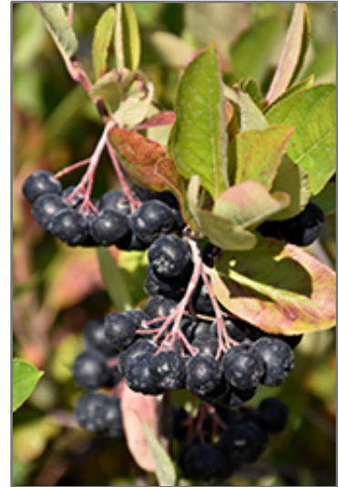
Viking Chokeberry fruit

This shrub should only be grown in full sunlight. It is an amazingly adaptable plant, tolerating both dry conditions and even some standing water. It is not particular as to soil type or pH, and is able to handle environmental salt. It is somewhat tolerant of urban pollution. This particular variety is an interspecific hybrid.