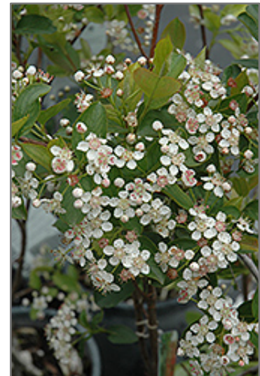
Viking Chokeberry flowers