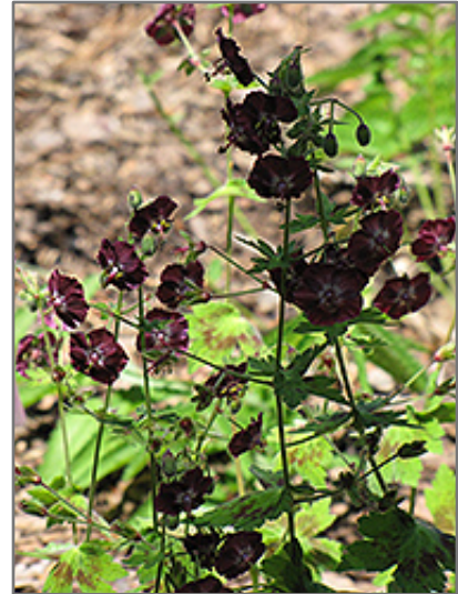
Samobor Cranesbill in bloom

Samobor Cranesbill is recommended for the following landscape applications;