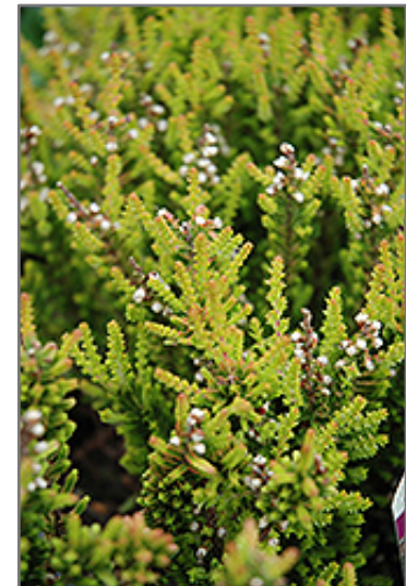
Firefly Heather foliage