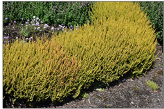
Firefly Heather

This shrub should only be grown in full sunlight. It requires an evenly moist well-drained soil for optimal growth, but will die in standing water. It is very fussy about its soil conditions and must have sandy, acidic soils to ensure success, and is subject to chlorosis (yellowing) of the foliage in alkaline soils. It is somewhat tolerant of urban pollution, and will benefit from being planted in a relatively sheltered location. Consider applying a thick mulch around the root zone in winter to protect it in exposed locations or colder microclimates. This is a selected variety of a species not originally from North America.