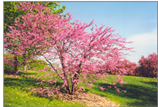
Northern Strain Redbud in bloom