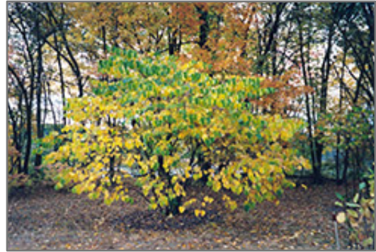
Northern Strain Redbud in fall

This tree does best in full sun to partial shade. It prefers to grow in average to moist conditions, and shouldn't be allowed to dry out. It is not particular as to soil type or pH. It is highly tolerant of urban pollution and will even thrive in inner city environments, and will benefit from being planted in a relatively sheltered location. Consider applying a thick mulch around the root zone in winter to protect it in exposed locations or colder microclimates. This is a selection of a native North American species.