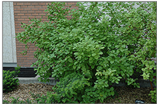
Siberian Dogwood