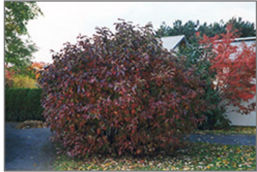
Siberian Dogwood in fall

This shrub does best in full sun to partial shade. It is an amazingly adaptable plant, tolerating both dry conditions and even some standing water. It is not particular as to soil type or pH. It is highly tolerant of urban pollution and will even thrive in inner city environments. This is a selected variety of a species not originally from North America.