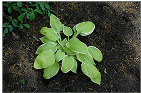
St. Elmo's Fire Hosta