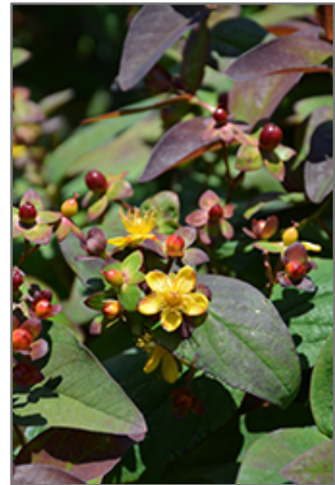
Albury Purple St. John's Wort flowers