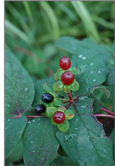
Albury Purple St. John's Wort fruit

Albury Purple St. John's Wort makes a fine choice for the outdoor landscape, but it is also well-suited for use in outdoor pots and containers. With its upright habit of growth, it is best suited for use as a 'thriller' in the 'spiller-thriller-filler' container combination; plant it near the center of the pot, surrounded by smaller plants and those that spill over the edges. It is even sizeable enough that it can be grown alone in a suitable container. Note that when grown in a container, it may not perform exactly as indicated on the tag - this is to be expected. Also note that when growing plants in outdoor containers and baskets, they may require more frequent waterings than they would in the yard or garden.