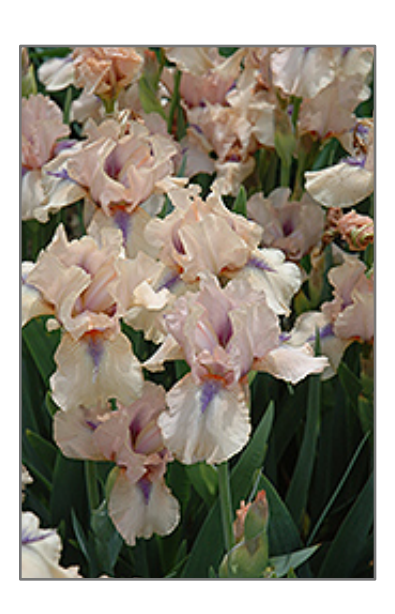
Concertina Iris flowers