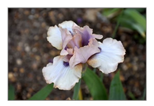
Concertina Iris flowers