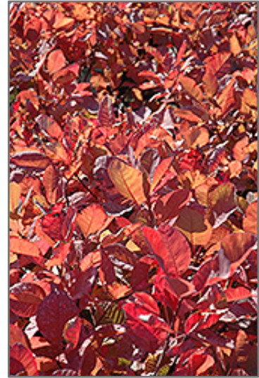
Grace Smokebush in fall

This shrub should only be grown in full sunlight. It is very adaptable to both dry and moist locations, and should do just fine under average home landscape conditions. It is not particular as to soil type or pH. It is highly tolerant of urban pollution and will even thrive in inner city environments, and will benefit from being planted in a relatively sheltered location. This particular variety is an interspecific hybrid.