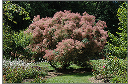
Grace Smokebush in bloom

Grace Smokebush is recommended for the following landscape applications;