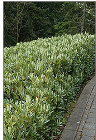
Otto Luyken Dwarf Cherry Laurel in bloom