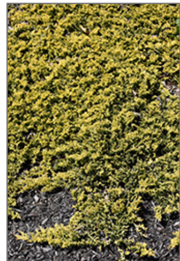
Mother Lode Juniper foliage