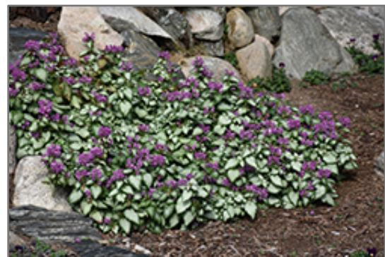
Purple Dragon Spotted Dead Nettle in bloom