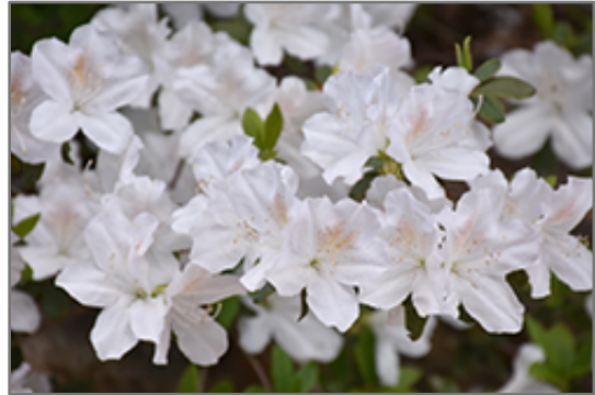
Delaware Valley White Azalea flowers