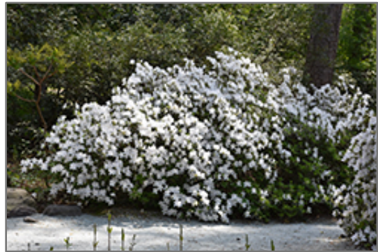
Delaware Valley White Azalea in bloom