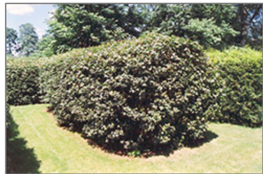
Hedge Maple