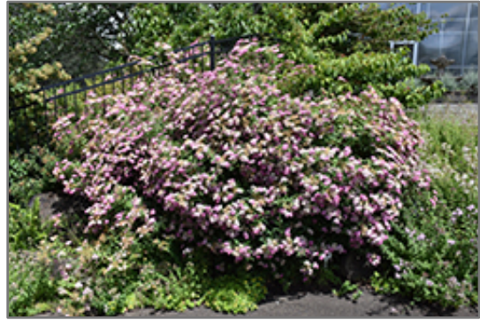
Lemon Princess Spirea in bloom

Lemon Princess Spirea will grow to be about 24 inches tall at maturity, with a spread of 3 feet. It tends to fill out right to the ground and therefore doesn't necessarily require facer plants in front. It grows at a fast rate, and under ideal conditions can be expected to live for approximately 20 years.