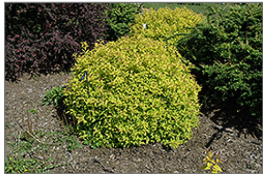
Lemon Princess Spirea